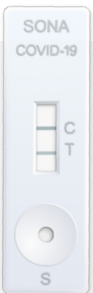
SONA COVID-19 Antigen Test Device