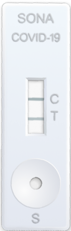
SONA COVID-19 Antigen Test Device